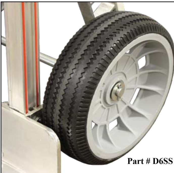
Part # D6SS

* Excellent shock absorption * Exceptionally light * Easy rollability * Extremely durable hub